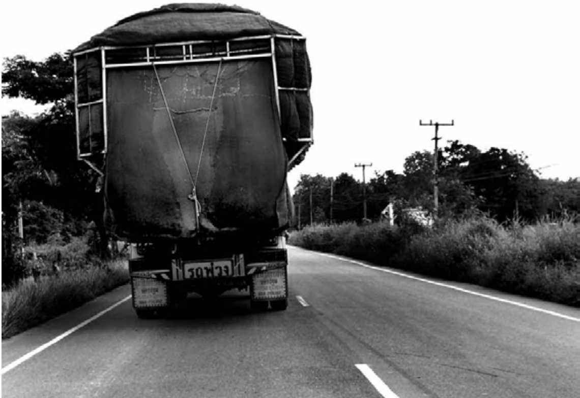
A truck piled with bags of rice husks on its way to the Pichit power station.

Local farmers in the region commented that they will have to replace this natural fertilizer with chemical fertilizers now because demand from the power plant has driven up the price of rice husks, meaning they are no longer affordable. 4 Local chicken farms and brick factories have to go further away to source rice husks, destroying a once self-sufficient system.