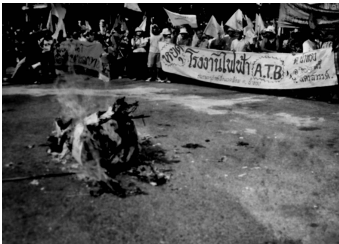
Banner reads, 'Stop the Electricity Plant A.T.B'.

This incident provoked the villagers to send a grievance letter to the local government. Initially, they were divided over whether the power station should be built, which caused strife in daily life as well as between family members. Eventually, they resolved to end their divisions. The entire community of Nam Song agreed to sign the letter stating their objections to the meeting and to the proposed station. The villagers then created the Nam Song Conservation Club to co-ordinate a full-scale campaign against the project.