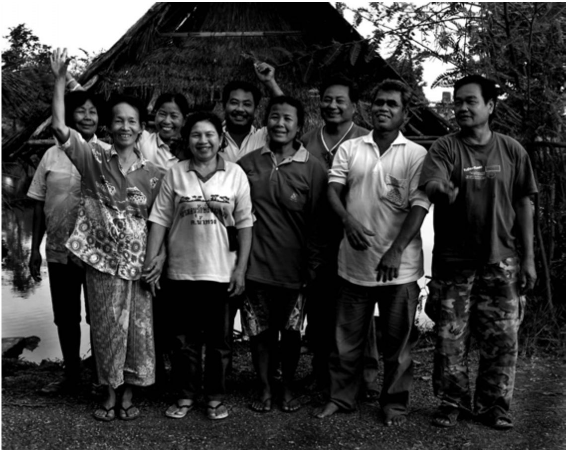
Members of the Nam Song Environmental Conservation Club