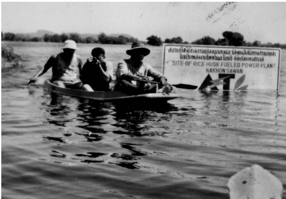
Site of proposed A.T. Biopower plant near Nam Song during the seasonal floods.

The developers used several tactics that are common in such situations in their attempts to stop the protests. Members of a community in the nearby Pichit province, who were also facing the possibility of a new biomass power station, were sent by the company to bribe the village leaders, offering them compensation to stop protesting. All of the village leaders were told by developers and local government they could be in danger if they continued the campaign. Various threats were made, large bribes were offered, and the villagers were repeatedly lied to in attempts to destroy their unity.