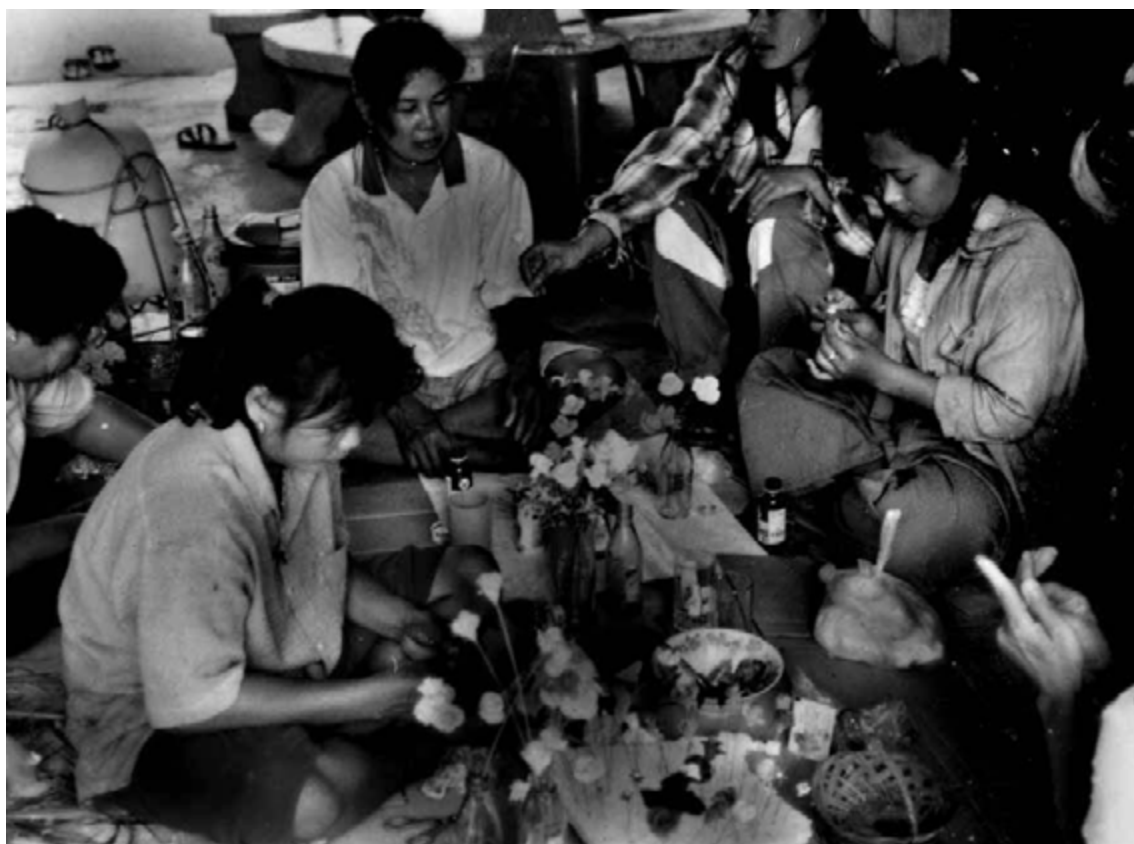
Women from Nam Song creating handicrafts for fundraising for the campaign.

The women in the village played an essential role in fundraising, organizing and maintaining trust within the community. The women made handicrafts and sweets to fundraise for the campaign. They sold t-shirts and sweets at meetings, which provided an opportunity to talk with others about the struggle and build trust. They canvassed an area of 10 km 2 and gathered 4,000 signatures for one of the rallies at the government headquarters.