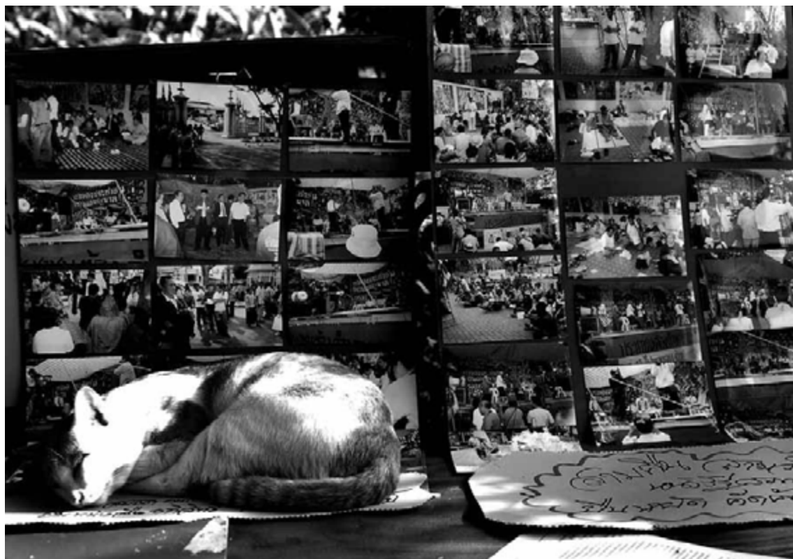
The Nam Song Conservation Club kept very good records of its campaign, including photos and notes from meetings.

And while for the moment Nam Song residents are protected from developers they still fear that other power plants will try to build on this particular site. The Nam Song Conservation Club remains committed to protecting their community from development projects because they are aware they may need to build another campaign at any moment.