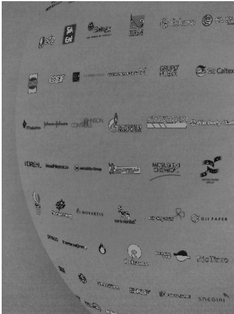
Figure 1: The world according to the World Business Council for Sustainable Development: a smooth earth populated by corporate logos. From the WBCSD display at the 2008 World Conservation Congress of the International Union for the Conservation of Nature.

WBCSD stand at the 2008 World Conservation Congress, is suggestive of its planetary reach and ambition. It depicts the brand logos of many of the world's largest multinationals, stretching across an abstract earth, smoothed of difference, diversity and inequality. This is a world good for capital. But is it also good for cultural and ecological diversity?