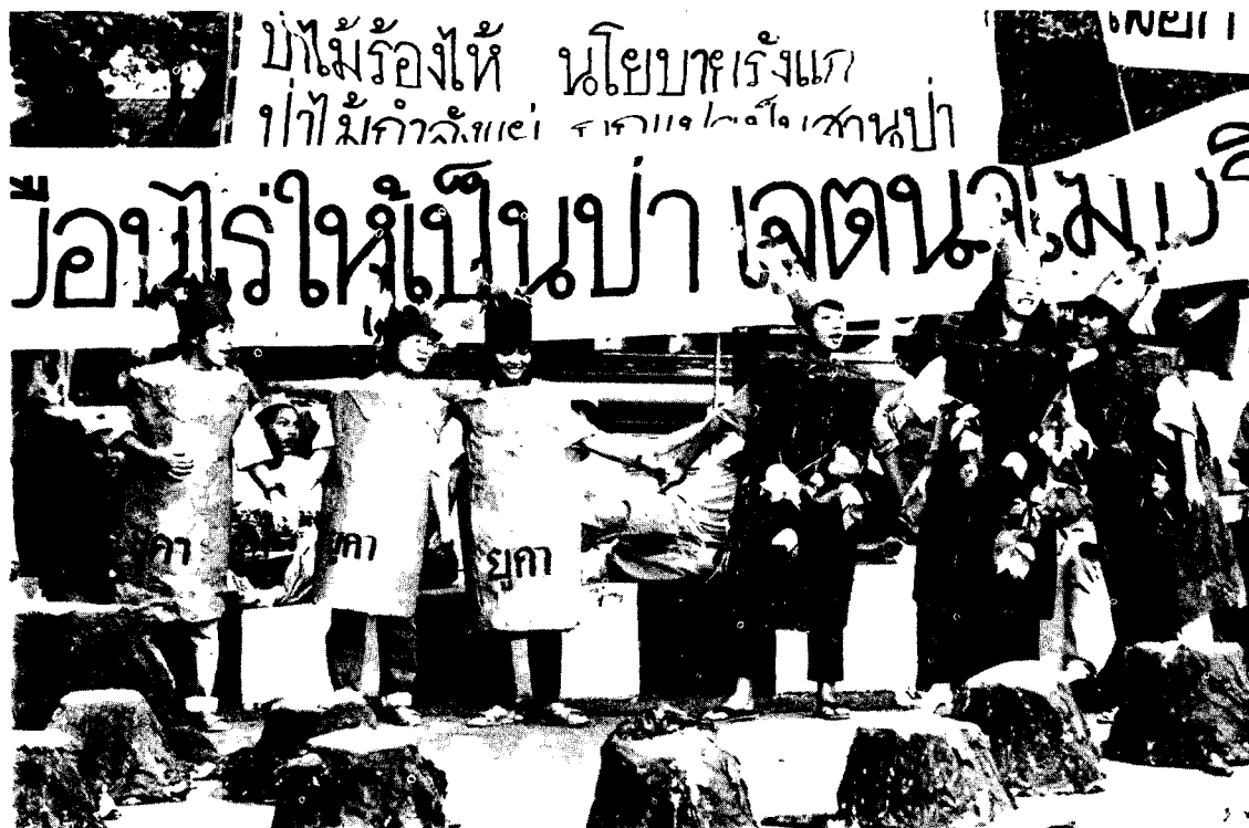
During Environment Day on 6 June 1990 a number of university students performed a satirical skit outside Government House in Bangkok to protest the government's failure to protect the country's remaining forests. The activists called on the government to minimize private investors' use of forests for commercial purposes. Here students dressed as eucalyptus trees celebrate their "triumph" over the "stumps" of the natural forest in the foreground. The rearmost sign behind the skit reads: "Molested by policy, the forest is crying, in terrible shape, and is being turned into plantations."

formulate the TFAP and has served both FAO and the World Bank, sets aside the bulk of the planning budget for matters related to the forest industry. Little consideration is given to local, nonmarket use of forests, and not much more to conservation. The main thrust is to "maximize the economic benefits obtainable through forestry development" through "increased forest production" and the "development of other sectors." 68