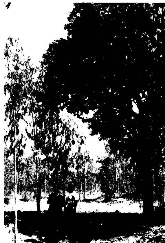
Villagers in Ubon Ratchathane Province with stumps of native trees that were cleared to make way for the young eucalyptus trees now several meters high. After five to six years of growth, the eucalyptus trees are cut and allowed to coppice for a comparable period before being harvested again. On the right is a lone fruit tree allowed to stand in the middle of a eucalyptus plantation. The fruit, insects, wood, and fodder such trees provide cannot be derived from eucalyptus—one reason why farmers are opposing the advance of the Australian tree.