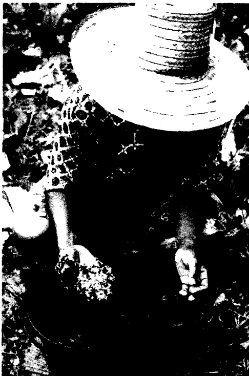
Separating red ants from their eggs in a bucket of water. The eggs are a protein source and ingredient in spicy local laab salads. One of the most scathing comments by villagers on eucalyptus plantations is that "not even red ants can live there"—reflecting not only the plantations' ecological harshness but also the way they threaten food subsistence.