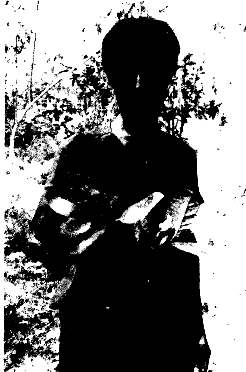
A native medicinal herb from a local forest. Among villagers' objections to eucalyptus plantations is that they reduce the availability of such herbs, which the cash economy cannot provide any free replacement for.