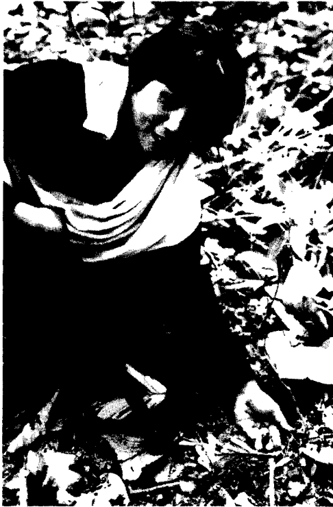
Digging for edible insects in a community forest threatened by eucalyptus. Such items of everyday subsistence cannot be found in eucalyptus plantations even when villagers are allowed access to them. The plantations thus threaten the security of local livelihoods. All the photos on this page show northeastern villagers and are by and courtesy of Sanitsuda Ekachai.