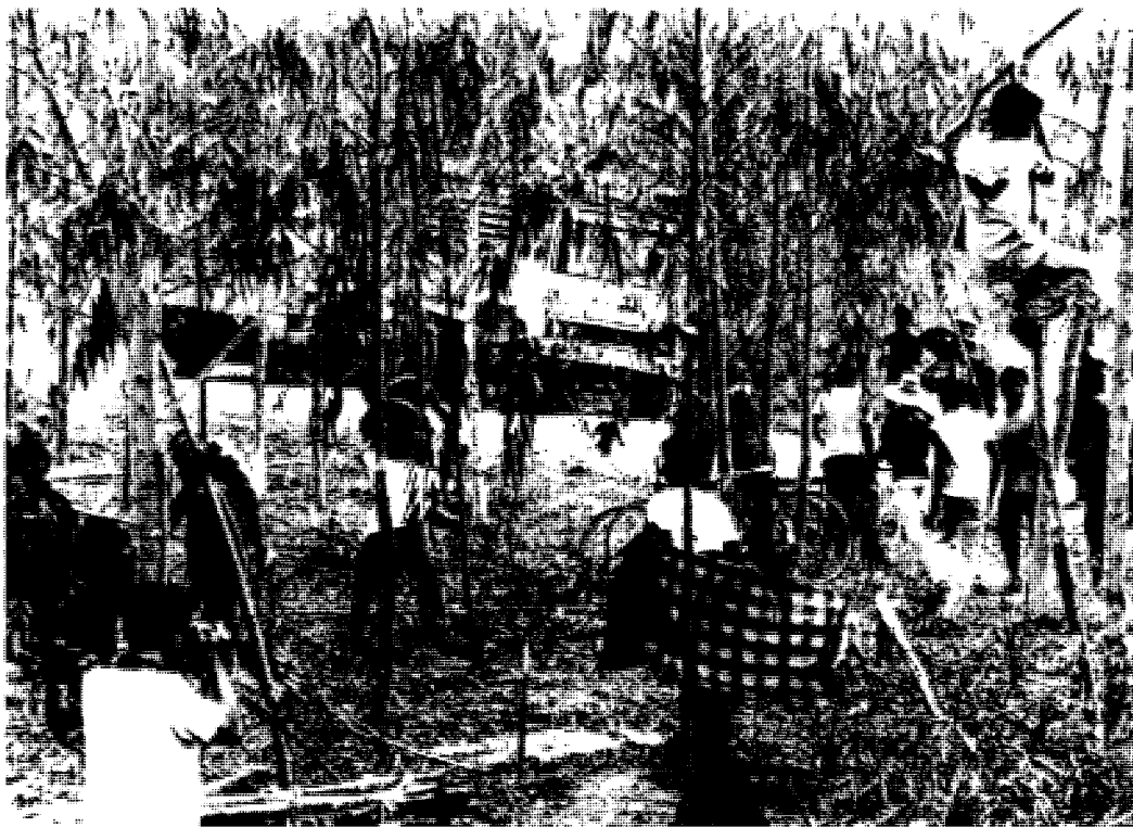
Angry villagers cutting down eucalyptus trees in Pakham District of Buriram Province in Thailand in March 1988. Farmers in this area, who moved there within the last two decades and collaborated with the army in anticommunist military campaigns, regard eucalyptus plantations as a threat both to their land security and to the remnants of national forests that feed local streams.