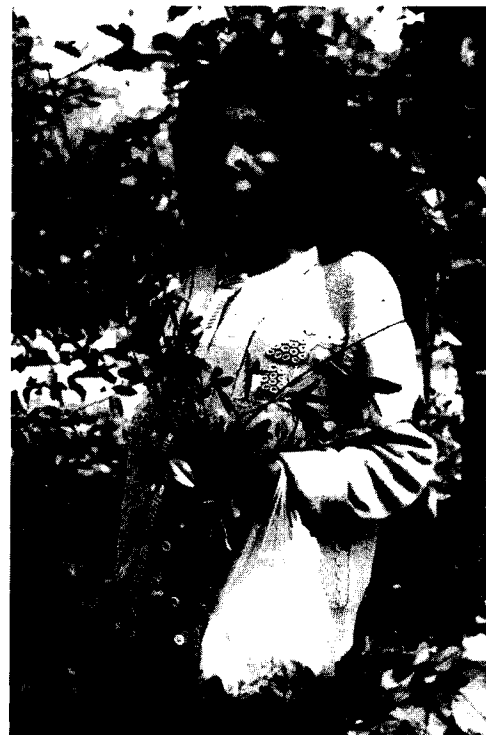
Returning from a collecting trip to a local woodland with a bounty of edible leaves and other products. Such woodlands are often classified as "degraded" by the government as a prelude to being razed to make way for eucalyptus plantations. Villagers partially dependent on the woodlands for subsistence often respond by burning down eucalyptus nurseries or cutting down saplings.