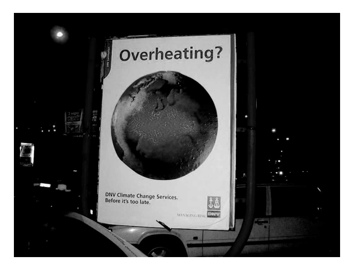
Figure 4. A carbon-dump consultancy company advertisement.

plant independently of the CDM, they have been interested since at least April 1998, around the height of the Thai financial crisis, in securing supplementary funding through carbon trading (FAO, 2000).