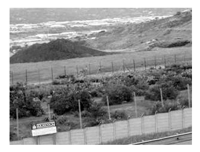
Figure 3. Bisasar Road dump, Durban.

In 2002, the Prototype Carbon Fund threw a lifeline to what it came to call an 'environmentally progressive ... world-class site' in the form of support for a project to extract methane from the landfill and use it to generate up to 45 megawatts of electricity for supply to the national grid. Two individuals—Sandra Greiner and Robert Chronowski at the PCF in Washington—certified that this electricity would 'replace' electricity which cannot be foregone and which otherwise could have been generated 'only' by burning coal (World Bank, 2003). [Without the US$15 million provided by the deal, Durban officials said, they would not bother trying to recover the methane as fuel, since the electricity generated in the process costs so much more per kilowatt hour than the local power utility charges for its coal-fired power (Reddy, 2005).] Accordingly, PCF investors—including British Petroleum, Mitsubishi, Deutsche Bank, Tokyo Electric Power and Gaz de France, as well as the governments of The Netherlands, Norway, Finland, Canada, Sweden and Japan—are to get pro rata shares of rights to ignore an increment of their obligations under the Kyoto Protocol to reduce their own mining and burning of fossil fuels.