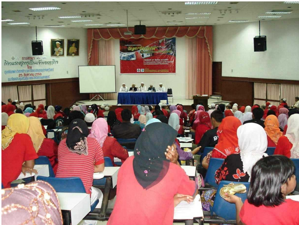
Participants listen to a panel of scholars discussing waqf land and Islamic law.

27 August 2007 – Muslim intellectuals and religious rights scholars today voiced questions about the way officials have treated what locals claim is Muslim waqf common land in the disputed Trans Thai-Malaysia pipeline and industrial project (TTM).