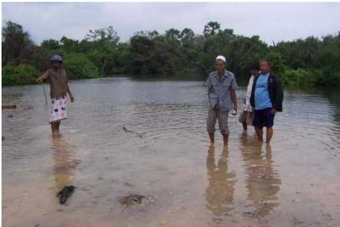
Villagers survey stream damage they say was caused by construction.

Worst of all, he added, they were destroying both the principles of Islam and the land, water and air that belonged to Allah. Pa Ngam village, Mr Raufate said, was suffering foul smells from gas released from the cracking plant.