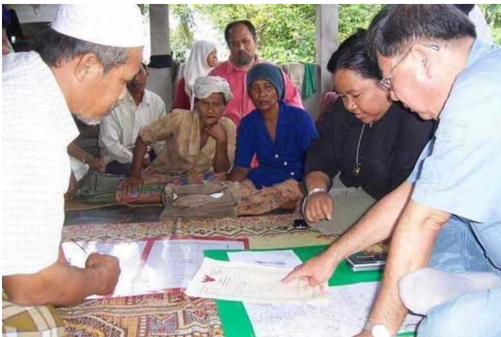
Chana villagers confer with National Human Rights Commissioners.