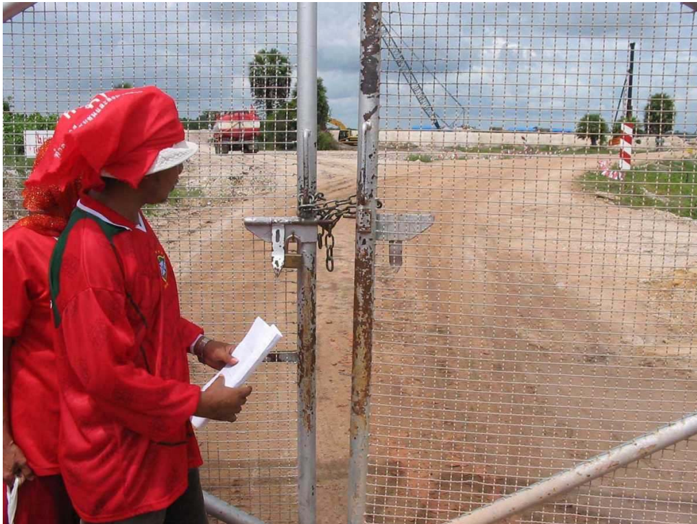
Fenced out: TTM has blocked access to land that local villagers say is waqf.

unless it is waqf associated with a mosque, in which the mosque has to look after it.