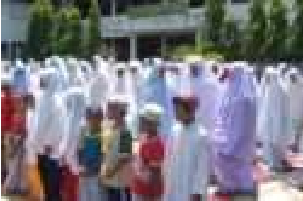
Chana villagers gather at the Songkhla Land Office.