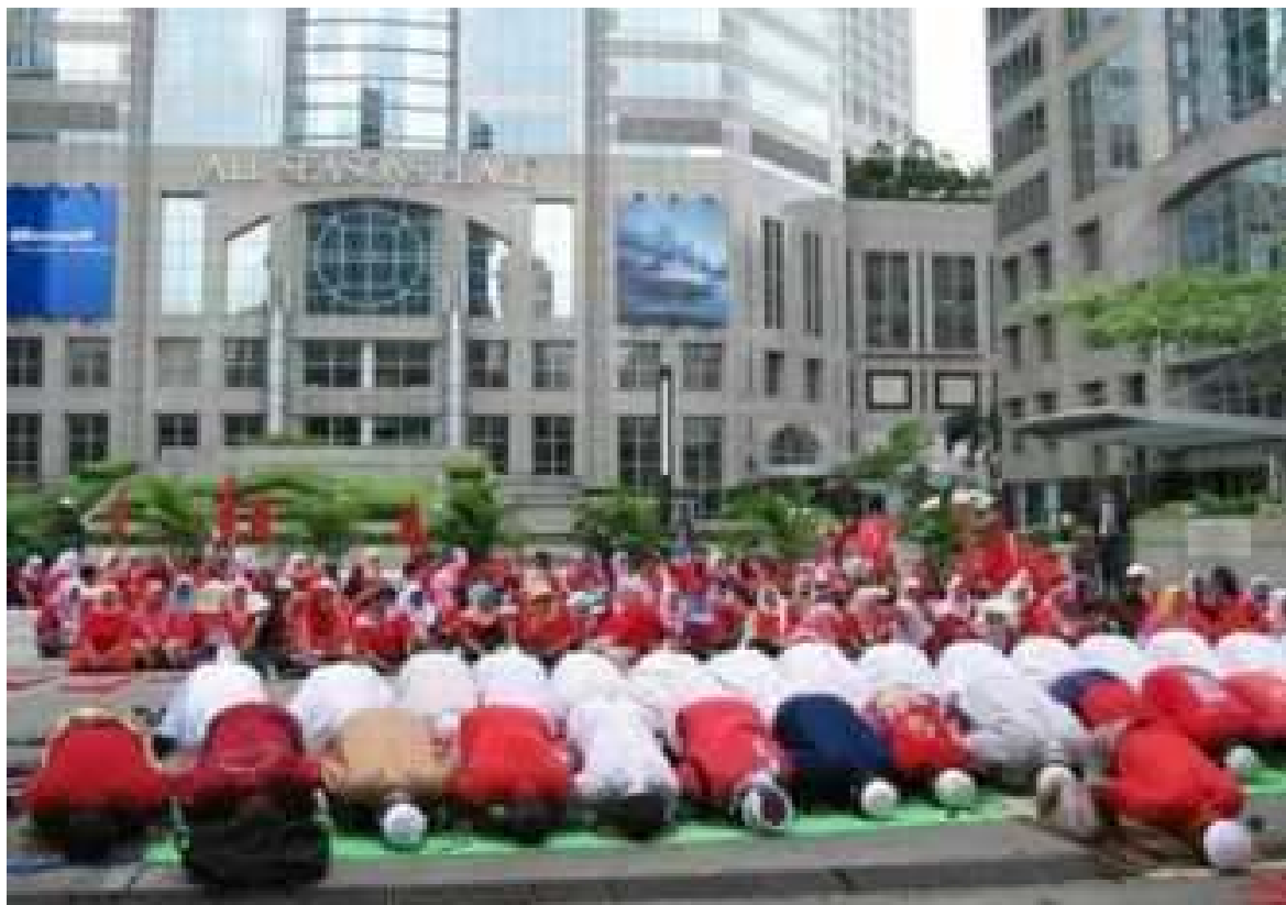
Chana villagers at prayer during a mass protest at Barclays’ Bangkok office, June 2004.

International investors in TTM have exploited a parallel story, that of ‘corporate social responsibility’, that allows them to temporise indefinitely in their relations with local people while isolating them from, and organizing the consent of, middle-class audiences outside the country. For example, Barclays, the key foreign backer of TTM, has been a leader in formulating the voluntary Equator Principles for the international banking sector. These ‘require’, among other things, that an Environmental Impact Assessment (EIA) involving mandatory public consultation is carried out on all projects to be financed. ‘We will take the necessary steps to understand the impacts that our business may have on the communities with which we interact, including human rights impacts,’ Barclays states. ‘Where there is potential for our operations to cause human rights violations we will take whatever action is necessary to avoid them’. 15