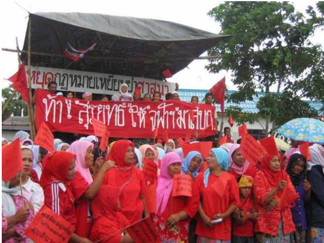
Anti-pipeline protesters in Chana district express outrage at what they perceive as insults to their religion.