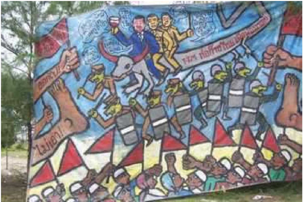
Prime Minister Thaksin Shinawatra and military officers are depicted riding a lizard representing the TTM gas pipeline project, drinking alcohol and exulting “I’m so rich!”. Doglike soldiers guarding them contemptuously threaten protesting villagers: “Arrest the animals!” Villagers respond by showing the soles of their feet to the project: “Get out!”

They added that foreign corporations had been allowed to rise above the law by the corrupt and dictatorial government of Prime Minister Thaksin Shinawatra and had taken over and destroyed village lands.