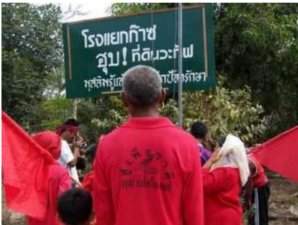
“The gas separation plant has grabbed waqf land! Once Muslims realize this, they have to rise up to protect it.”

They said the Trans-Thai Malaysia Pipeline company (TTM) was trampling on the Muslim faith by seizing waqf , or Islamic commons held in perpetual trust for community use, as a site for its gas cracking plant in Chana district of Songkhla.