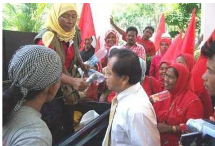
A pipeline protester holds the microphone for a Prosecutor's Office official.