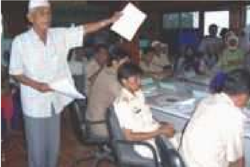
The scene at the Sakorm TAO meeting today.