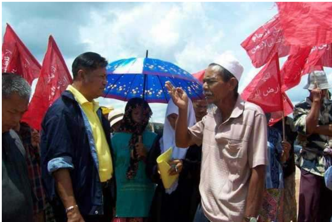
Chana villager attempts to reason with PTT public relations officer.

12 June 2007 – Some 50 opponents of the Trans Thai-Malaysia pipeline today took their fight directly to the Petroleum Authority of Thailand at the company's gas separation plant in Chana when they presented senior staff with a petition demanding a halt to construction work on a new pipeline to an electricity generating station.