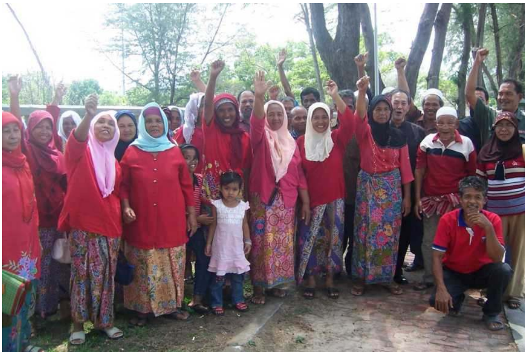
Villagers celebrate the court's decision on former police chief San Sarutanon.

The 20 December rally by TTM opponents, the court said, was a proper exercise of the plaintiff's constitutional rights. The protesters had no intention of provoking violence or blocking the cabinet meeting being held that day. The police had the duty of protecting them, facilitating the rally, and preserving public safety. Pol Gen San in particular had a duty to be sensitive to the toll that TTM had already taken on the lives of the protesters, and take care about the use of force.