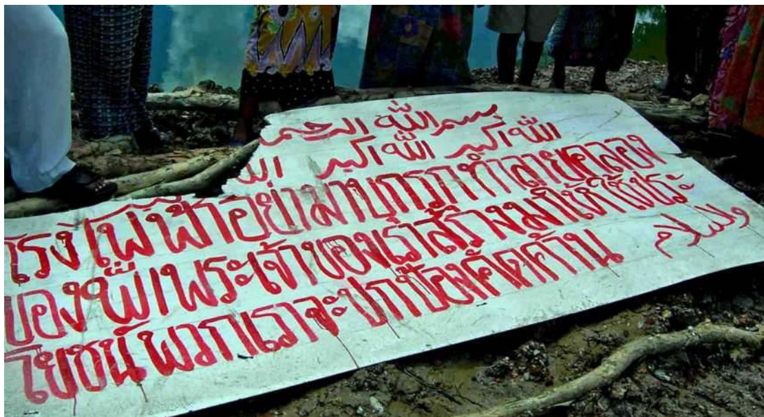
The trashed protest sign.

Residents of Pa Ngam and Klong Pia in Chana district of Songkhla said that the sign, which bore the messages, "Don't trespass on Allah's stream" and "Allah provided it for all our use and we will defend it", had not been erected on the land of the Electricity Generating Authority of Thailand (EGAT), the manager of the plant.