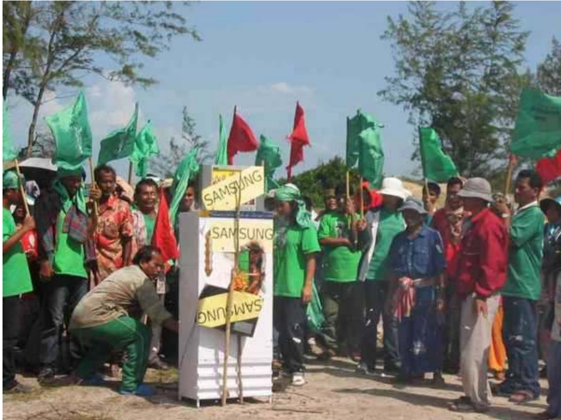
Samsung comes under attack by Chana villagers.