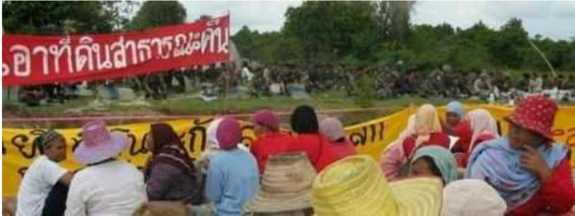
Villagers and police face off during a vigil at the gas plant site at Chana. The banner in the background reads: "Return the public's land".

One of the most crucial points of resistance was land. To bring the pipeline ashore, TTM, with the connivance of local officials, acquired public land along the community's beachfront using private land titles that were later determined by the National Human Rights Commission to be bogus. Despite villagers' petitions to civil servants, police and parliamentarians, and the findings of a Senate committee, the land was enclosed and villagers driven out. In July 2005 the Sakorn subdistrict administrative organization resolved to sue TTM for breaking the law forbidding encroachment on public land. Villagers had earlier filed encroachment charges against Samsung, the TTM's subcontractor that had taken over the beachfront area, only to find that Samsung had managed to get the police to issue arrest warrants for villagers, also on trespass charges. Throughout, local villagers have maintained a peaceful resistance camp on a nearby beach, Lan Hoy Siap, and in 2006 launched a tree-planting scheme on disputed public forest land.