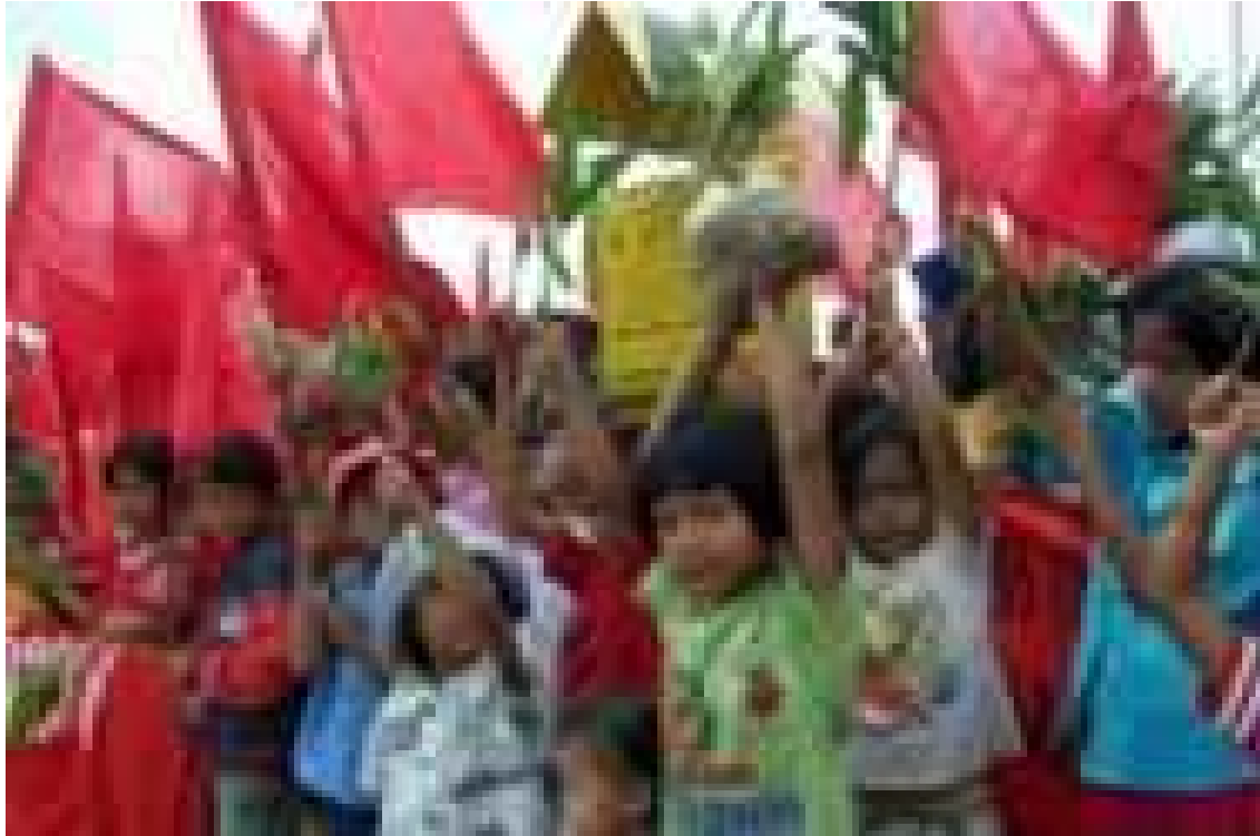
Local children hold up seedlings to be planted on the disputed land, including betel palms, coconuts, acacia, payawm and various medicinal species.