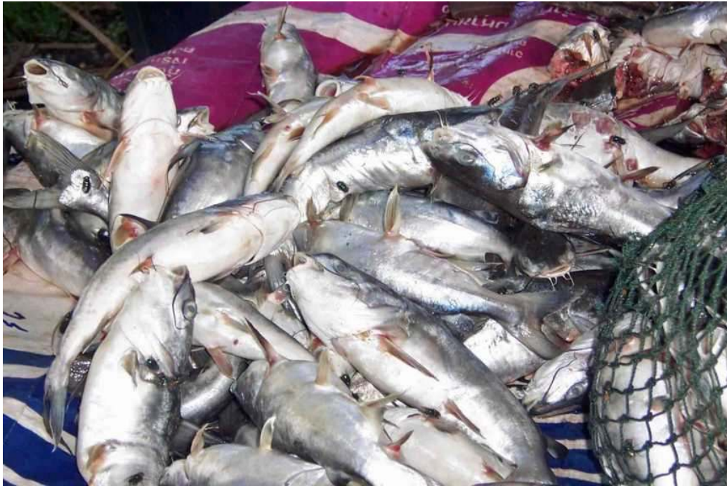
Some of the dead fish found floating in Klong Naa Thap yesterday.

Raufate Hatumsa of Pa Ngam village near the stream said that although there had previously been cases of pollution from an agricultural processing factory in the vicinity, there had never been such a fish kill before.