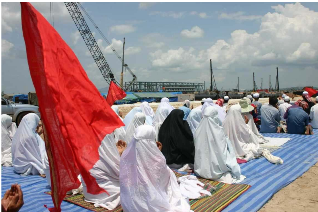
Villagers at prayer on the site of the seized waqf land.

Thaksin is locally regarded as having followed a policy sanctioning widespread murder with regard to Thailand's troubled southernmost provinces. The insult to Islam suggested by official dismissal of the waqf status of the land in question – together with the breach of state law implied by the seizure of the land before its public status was revoked – has only fueled resentment.