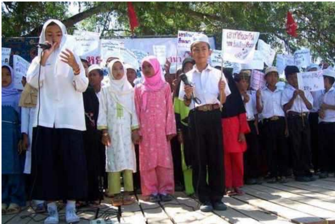
Local children help open the forum.

Thaksin's government's claim that local communities no longer used the land was false, villagers said. Public rights of way had been crucial for villagers to get from place to place, gain access to local forest and plant vegetables and melons. Moreover, the land in question was waqf under Muslim law, meaning that it could not be transformed into private property.