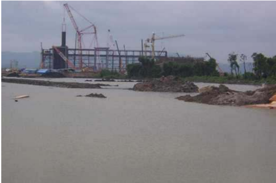
The site of EGAT's new power plant in Chana district.