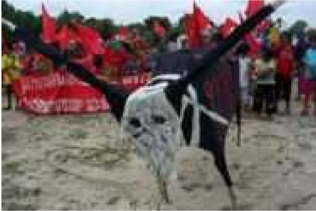
The “Thaksin” buffalo gets a roasting.