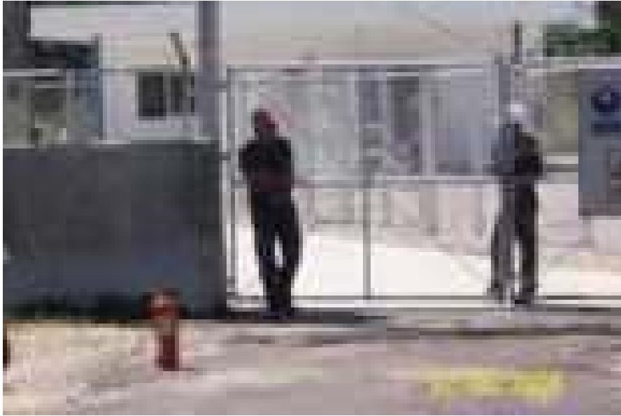
The scene at the valve station on the morning of 6 February.

A TTM engineer called to the scene said the short circuit had been caused by a snake getting into the transformer but refused to comment further.