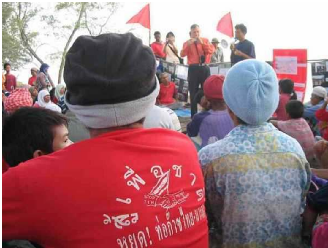
Villagers brief senators on the pipeline situation. The slogan on the T-shirt of the villager in the foreground reads: "Fight for our country! Stop the Thai-Malaysia pipeline!"

At 10:00 am, the Commission travelled to the Chana district office in order to attend a meeting with the Deputy Governor of Songkhla province, the Sheriff of Chana, representatives of the Chana land office, and Police General Anurut Im-aap, Commander of the Special Ad Hoc Police Task Force maintaining safety at the construction site. The villagers asked to send a representative to observe the proceedings as well. When they went into the meeting room, they discovered that TTM company officials were already sitting there, waiting to observe.