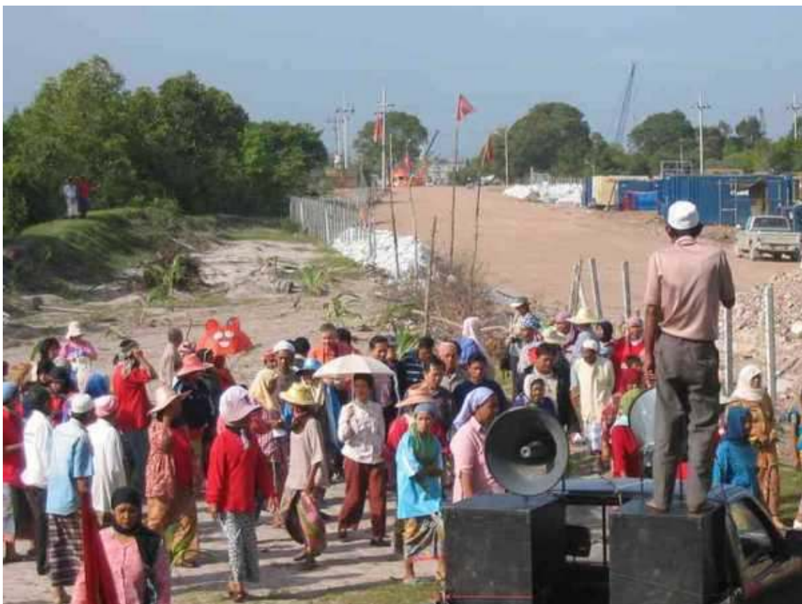
Chana villagers conduct senators on a tour of common areas seized and destroyed by TTM.

After briefing the Commission members, the villagers accompanied them to view the public rights of way seized by TTM for the construction site for the gas separation plant. These rights of way have been altered greatly as a result of TTM's invasion and the initial stages of construction.