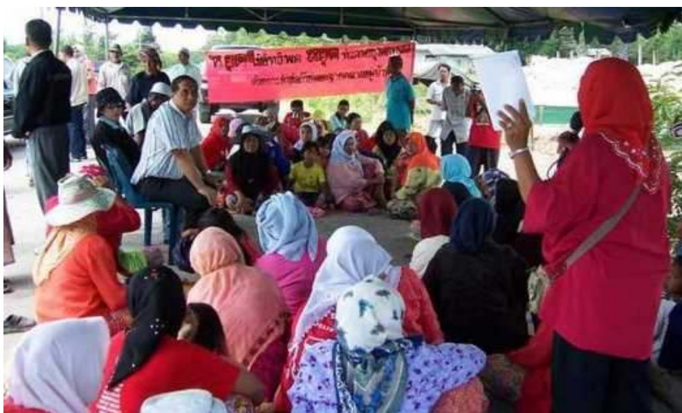
A local resident voices her grievances to Maj Gen Jamlong.

If PTT took the national interest to heart, Maj Gen Jamlong said, it should agree to consider a route for the pipeline that did not have such impacts on local villagers. He added that for army, police and TAO officers to threaten villagers with armed force to get the pipeline through was unacceptable and an abuse of power.