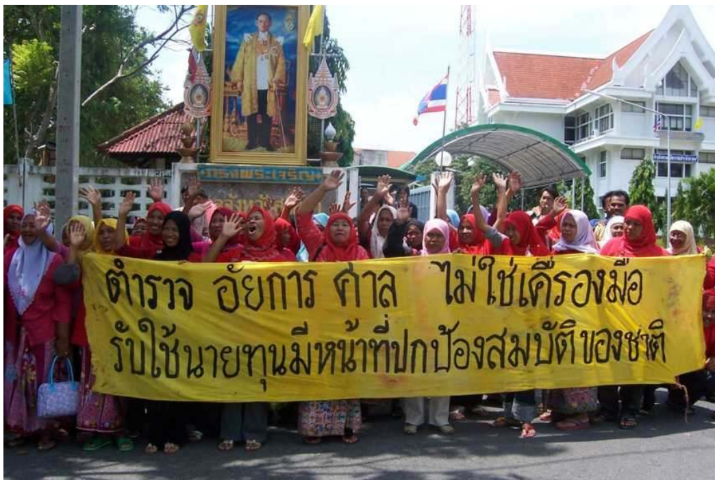
Chana villagers celebrate the court's decision. The banner reads: "Police, prosecutors and the courts are not tools of business – they have the duty to protect the nation's wealth."

“The right of communities to their own natural resources is a human right even if there is no law certifying it as such. This should be a lesson to the government and the police to remember the rights of communities and the public, not just to promote the interests of private companies.”