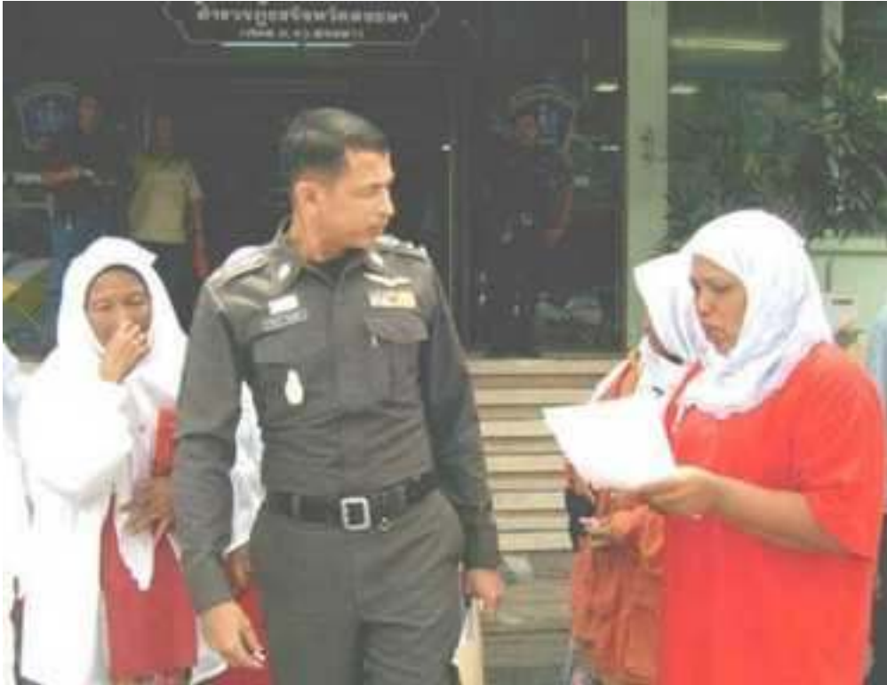
Villagers question police.