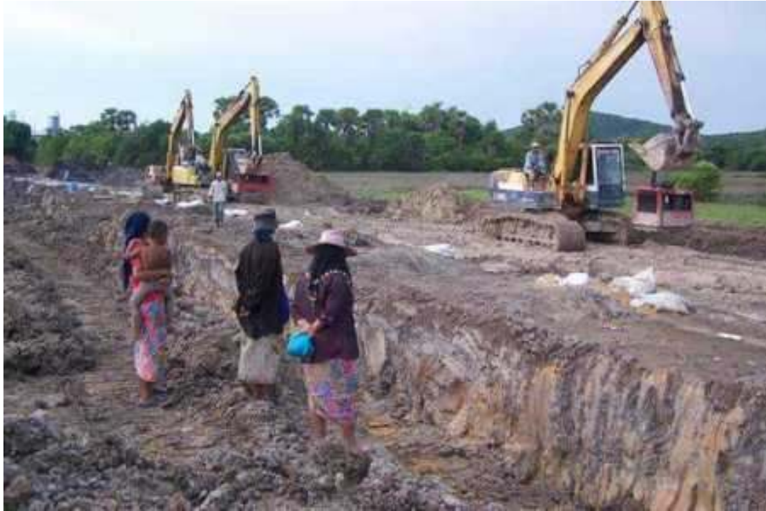
Construction underway on the pipeline to the electricity plant.