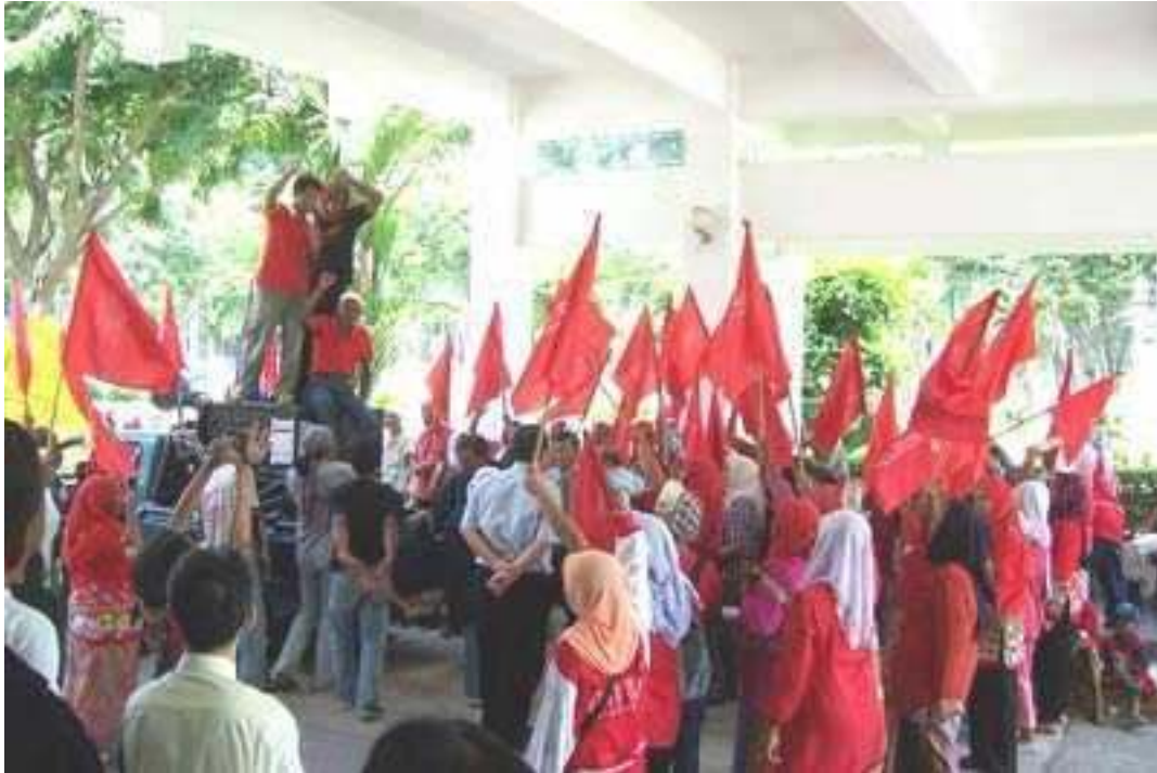
Protesters occupy the Songkhla Prosecutor's Office grounds.