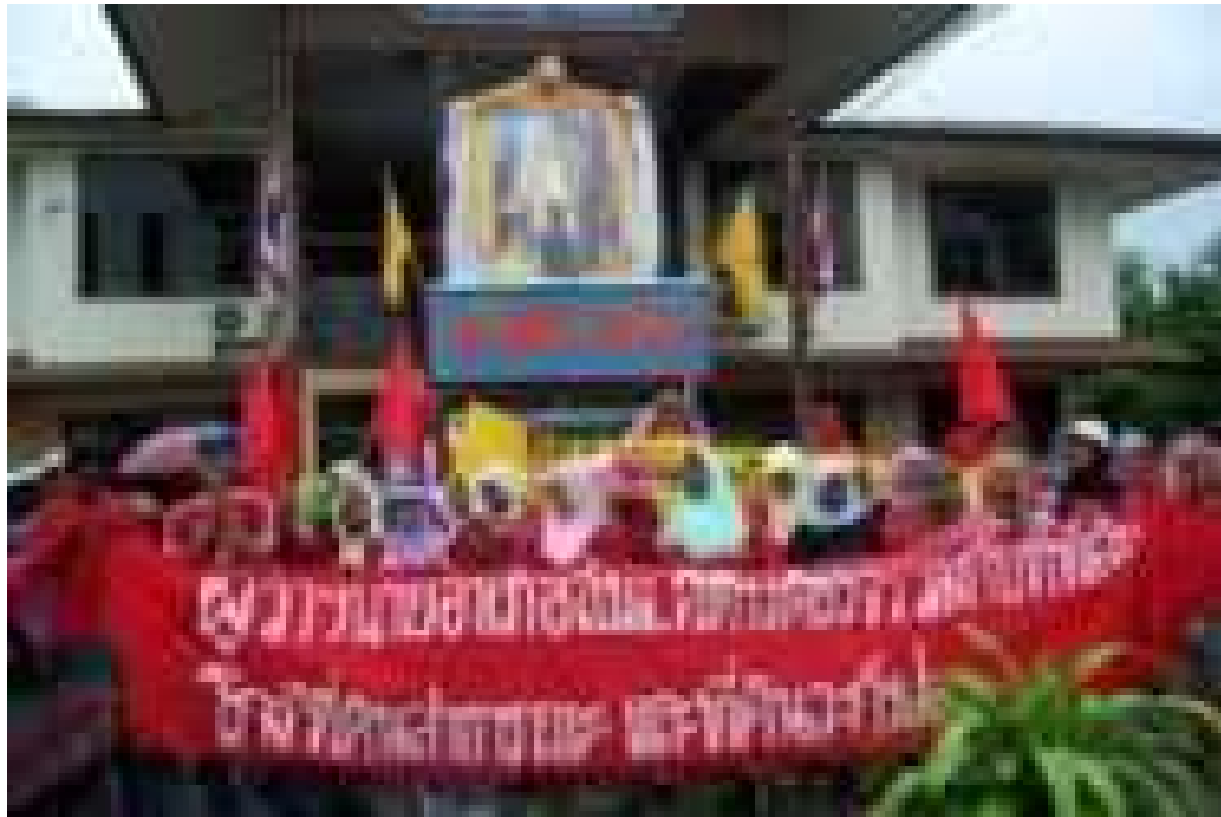
Villagers demonstrate at Chana district police station, Southern Thailand.