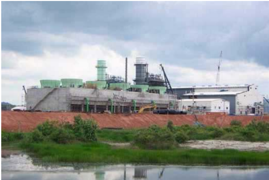
The EGAT electricity generating station at the end of the pipeline.