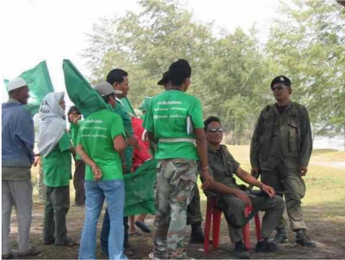
Visitors from Bo Nok and Baan Krut confer with police at Chana.

At 13:00, villager opponents of the TTM project paraded an effigy in the shape of a water buffalo labelled “Governor of Songkhla, Sheriff of Chana, Police”, ridden by a figure labelled “TTM”, around the public land fenced off by TTM.