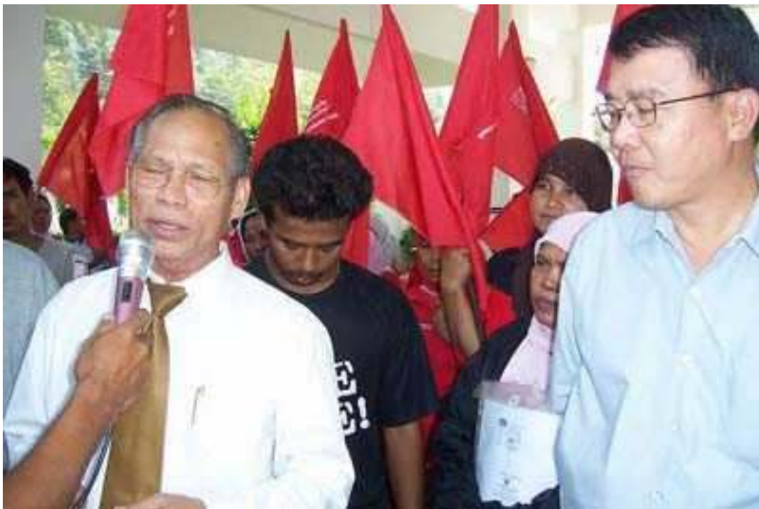
An official addresses the crowd.

It was a disgrace, they said, that Thai villagers who rose up to protect the country had been issued with arrest warrants at the behest of a Korean firm at a time when the local Chana district police knew well that the land that TTM had invaded was public land. Officials, they added, had also falsified land documents in the company's interest.