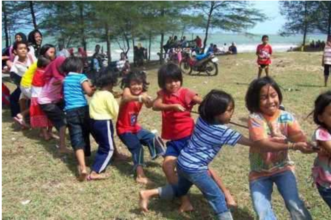
Tug of war on the beach at Laan Hoy Siap.

What with various blindfold games, three-legged races and other amusements, the beach was full of fun and laughter for the adults too.