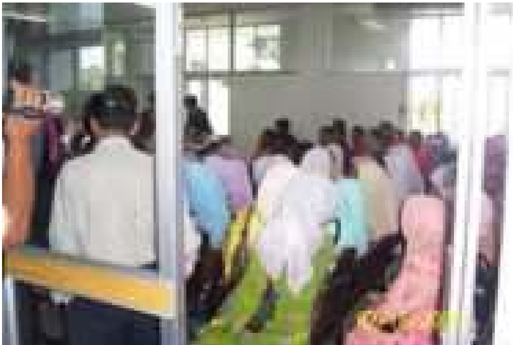
The scene in Room 209 of Songkhla Provincial Court.

16 February 2006 – Songkhla Provincial Court was abuzz with spectators today as examination of witnesses got under way in two cases in which police are accused of violence against the public.