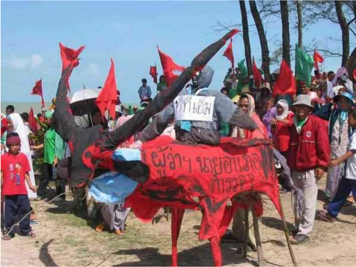
The TTM corporation pictured “riding” local government officials and police.

Representatives of the Bo Nok and Baan Krut villagers then condemned the behaviour of TTM and Samsung, noting that the companies had not listened to the voice of the villagers and had violated community rights. They then burned effigies of TVs, refrigerators and speakers labelled “Samsung”, announcing that henceforth villagers from all three areas would not use Samsung products, due to Samsung’s not ever having respected the rights of the community.