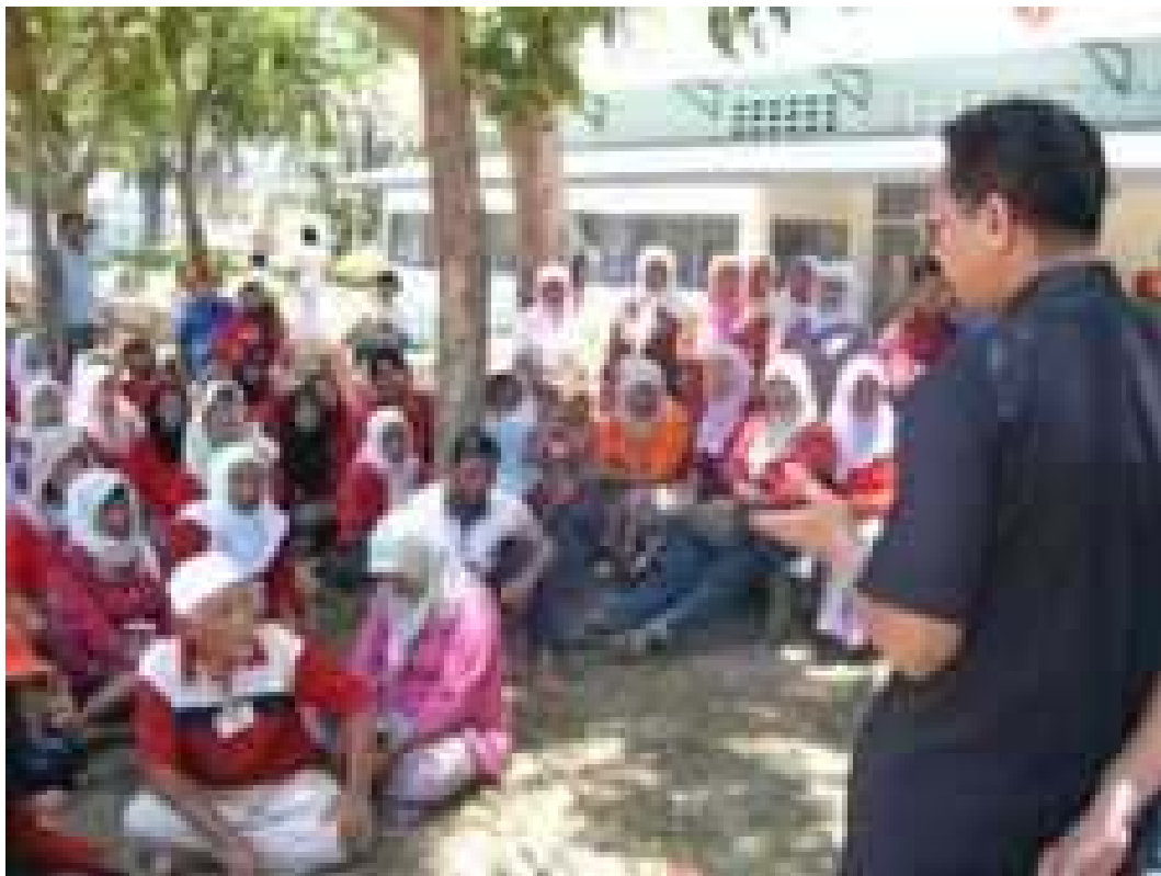
The scene at Songkhla provincial court today.

Some 80 red-shirted villagers from Chana showed up at the court to offer moral support.