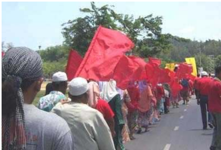
Opponents of the TTM pipeline and associated industrial projects on the march to the Songkhla Prosecutor’s Office.