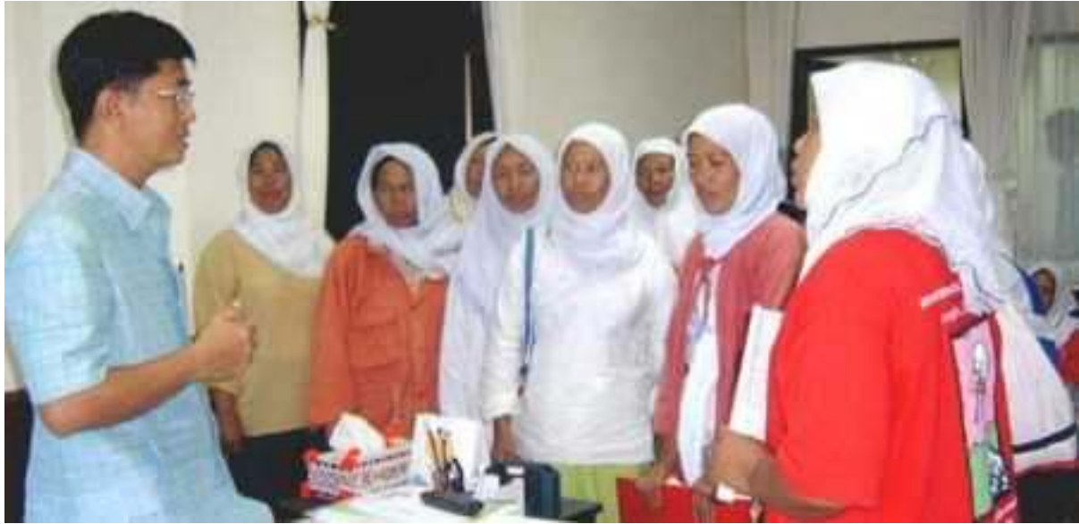
Chana villager representatives at Songkhla Provincial Hall.