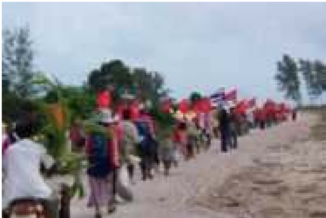
Villagers marching toward the contested seaside land.

Yiam sued a local villager in 1989 for trespass, but the Songkhla provincial court dismissed the suit in 1990 after the alleged trespasser pointed out that the land in question was public.