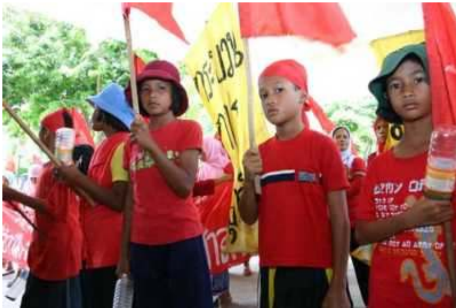
Chana children show their support.