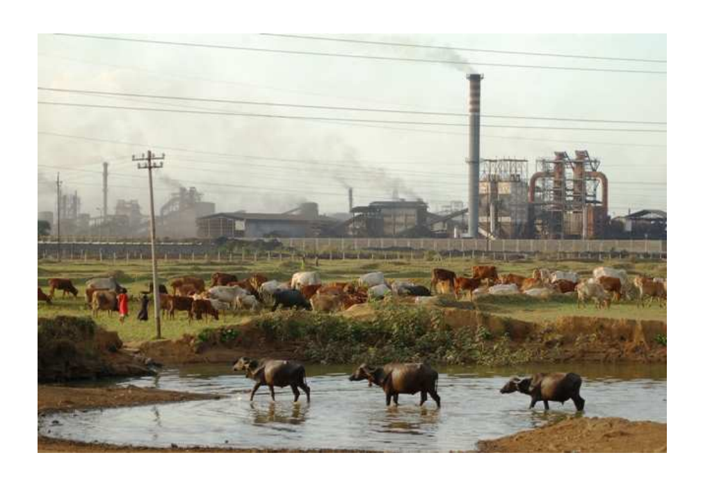
Sponge iron plants north of Raipur, Chhatisgarh.

the ground in countries such as India, which already boasts hundreds of offset projects contributing to the appropriation of local land, water and air. In the flat farmland outside Raipur, for example, factories producing sponge iron for export to China pumps out smoke that dims the sun and blackens trees, soil and workers' faces alike. Yet in return for documents claiming that they are making part of their operations more energy-efficient, many of the owners are selling carbon pollution licenses to the North through the UN. Local activists are concerned: with or without efficiency improvements, Chhattisgarh's largely coal-fired iron works will continue to spoil farmland and crops, usurp local groundwater, displace villagers, and damage the health of local residents. Farmers that are displaced are rarely hired to work in the factories, which are staffed mostly by labourers brought in from outside. Many displaced women are forced into prostitution. Closure orders were slapped on several of the plants for pollution violations in December 2006. To the activists, the firms' carbon schemes look like little more than opportunism on the part of a dirty and exploitative industry. Twenty kilometers away from the biggest complex of factories, many residents of Chauranga village would agree: they resorted to vigilante action to keep a nearby factory from operating for fear their livelihoods would be lost.